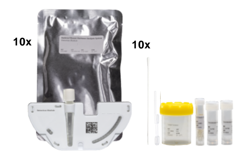
Figure 1: Picture of the Detection Module (left) and Concentration Module (right) of the Food & Beverage Kit, Type Spoilage Bacteria Ident L.