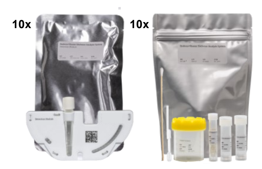
Figure 1: Picture of the Detection Module (left) and Concentration Module (right) of the Food & Beverage Kit, Type Spoilage Bacteria Ident L.